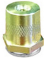
M6 - TPO6